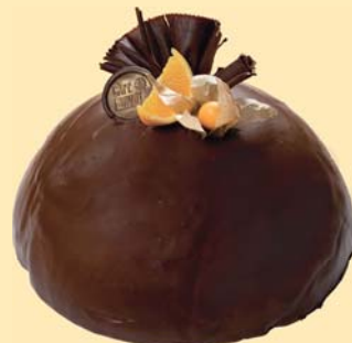
Vanilla dome with orange