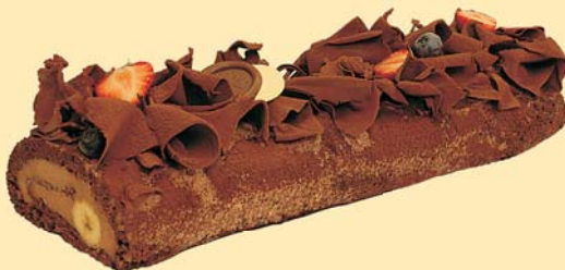
Parisian Swiss roll